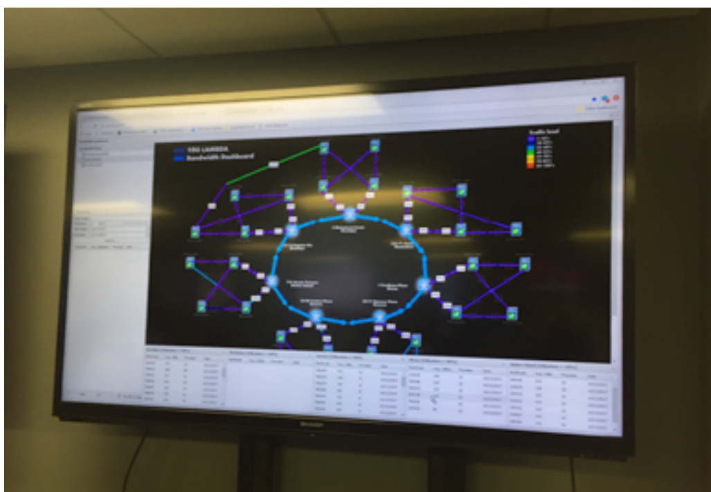
Figure 1: The citywide “ring” that comprises the DOE backbone visualized on a monitoring screen in the Department of Education’s Network Operating Center in Downtown Brooklyn.

■ Usually, internet traffic travels to schools via whichever of these seven nodes on the ring is geographically closest to the building. The traffic from the node to the school building goes through a wired connection, called a circuit, provided by either Verizon or Lighttower. This node to school connection is sometimes referred to as the “last mile” (and the problem of getting enough bandwidth through that connection is called the “last mile problem”). The speed of this connection may range, presently from 10 Mbps (the standard rolled out in 2007) to 150 Mbps, with some exceptions. The DOE is currently in the process of upgrading all circuits in the city to each school building to 100Mbps for single school campuses and 150 Mbps for shared campuses as part of its “School Circuit Conversion” project. According to a September 28, 2017 2 status report from the NYC DOE Department of Instructional and Information Technology (“DIIT”), “as of mid-April 2017, site surveys are 85% completed, 285 circuits have been migrated, 306 sites have been upgraded, and all school buildings will have upgraded circuits by March 2019.”