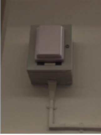
Figure 2: A WAP

One of the early problems Wi-Fi helped to solve, especially in older schools that may not have had extensive wired networks, was to create more areas in the building where the internet could be used, so long as those devices could be reasonably close to a WAP.